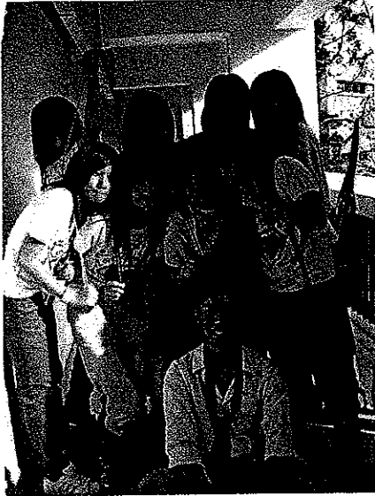
The dancers of 2C!!!!